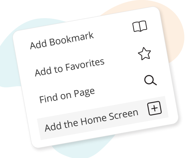
Scroll down and tap "Add to Home Screen"