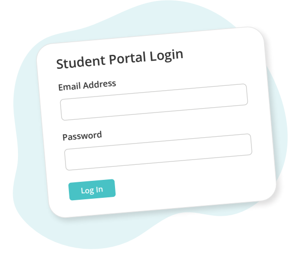
Sign in to the Student Portal on your phone